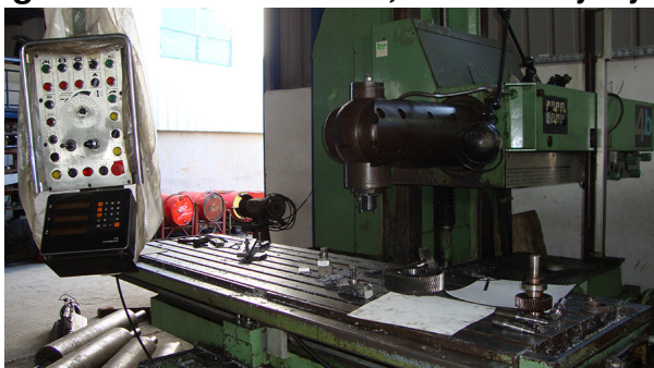
Fraiseuse Algerie nouvelle precision

.box_skitter_large67 {width:900px;height:500px;} .box_skitter_small {width:200px;height:200px;} .box_skitter {border:0px solid #000; background:#000} .label_skitter h5 { padding-left: 10px !important; } .label_skitter h5,.label_skitter h5 a{ margin:0; font-family: BebasNeueRegular !important; font-size:22px !important; font-weight:normal !important; text-decoration:none !important; padding-right: 5px !important; padding-bottom:0px !important; padding-top:5px !important; color:#fff !important; line-height:27px !important; display: block !important; text-align:left !important; } .label_skitter p{ letter-spacing: 0.4px !important; line-height:17px !important; margin:0 !important; font-family: Arial, Helvetica, sans-serif !important; font-size:12px !important; padding-left: 10px !important; padding-right: 5px !important; padding-bottom:2px !important; padding-top:0px !important; color:#fff !important; z-index:10 !important; display: block !important; text-align:left !important; } var ass67 = jQuery.noConflict(); ass67(document).ready(function(){ ass67('.box_skitter_large67').skitter( { dots: false, fullscreen: false, label: true, interval:6500, navigation:true, label:true, numbers:false, hideTools:false, thumbs:false, velocity:1, animation:"fade", numbers_align:'left', animateNumberOut: {backgroundColor:'#333', color:'#fff'}, animateNumberOver: {backgroundColor:'#000', color:'#fff'}, animateNumberActive: {backgroundColor:'#cc3333', color:'#fff'} } ); });